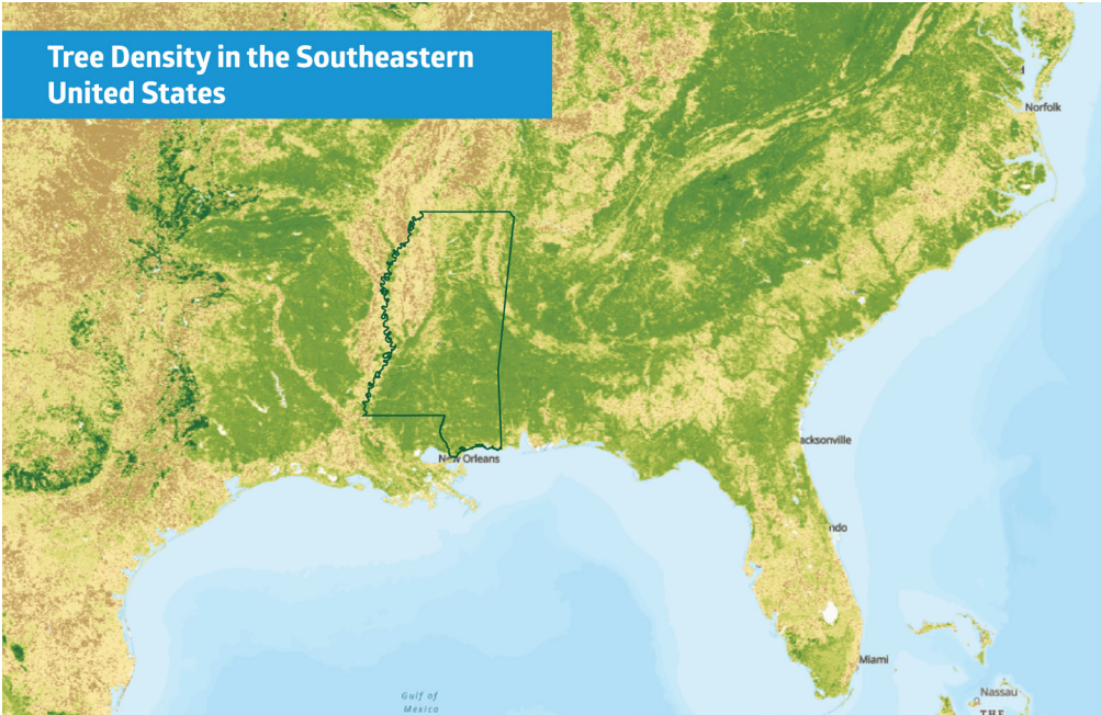
Source: Mississippi State University Extension Service, Data as of Q2 2021.