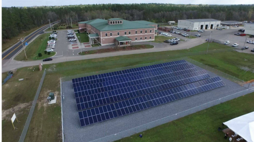
AN AERIAL SHOT OF THE SOLAR FACILITY AT COAST ELECTRIC IN KILN